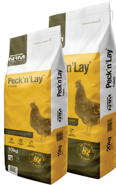
Product available in 10kg or 20kg.