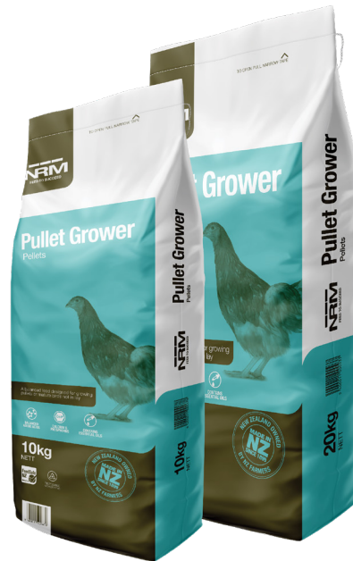
Product available in 10kg or 20kg.

For more information about poultry and NRM options please use the QR code below.