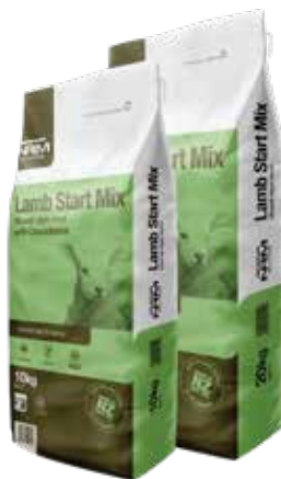
Product available in 10kg or 20kg.

Grains ensure a high energy density in lamb diets to support growth and rumen development when forage is being consumed without the need for high levels of fat – which can be bad for dry matter intake. Pelletting ensures essential micronutrients are evenly distributed and locked into every pellet to eliminate sorting and selection issues in transit, storage and during consumption.